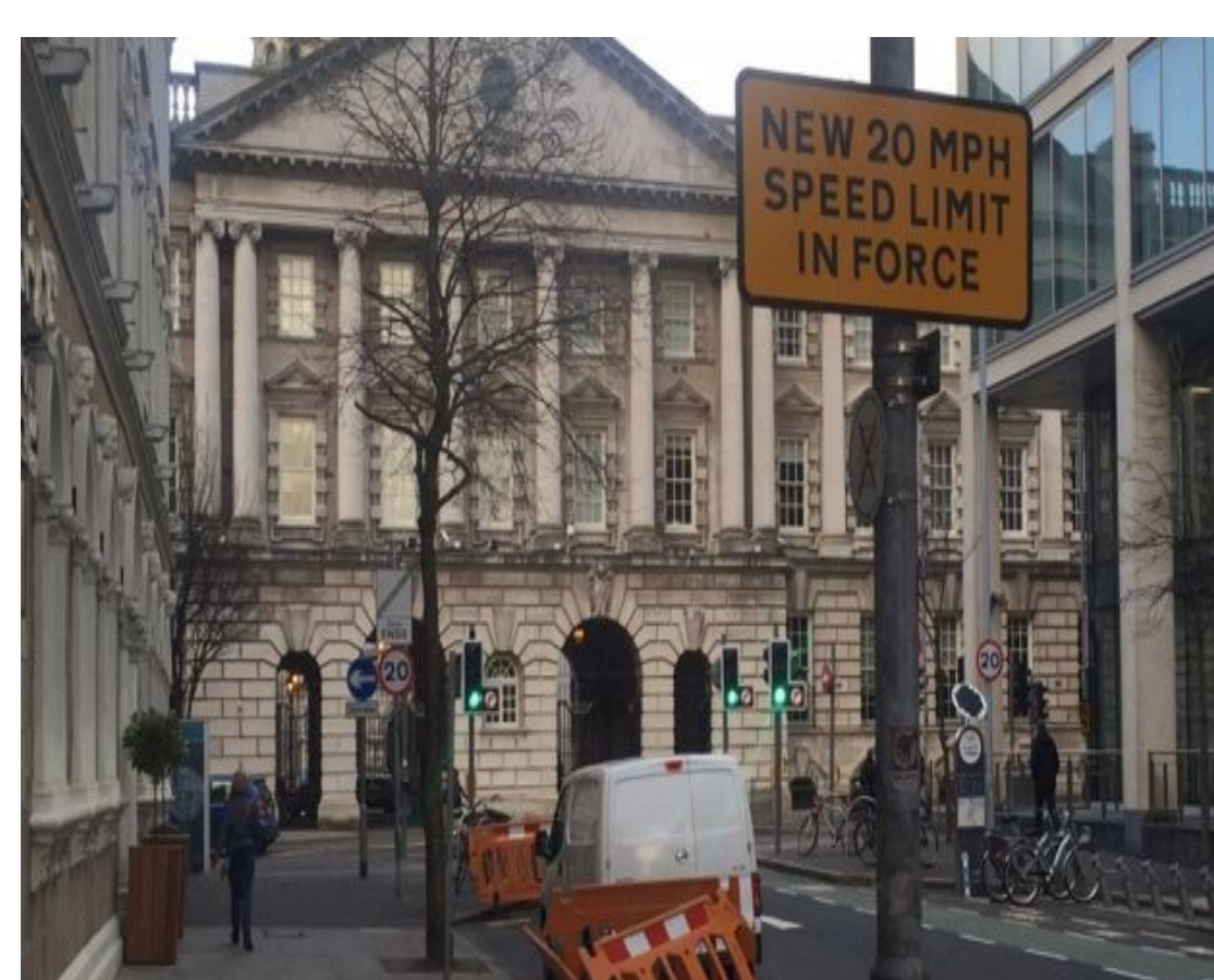
Photo 1. Sign informing public of new 20mph speed limit.