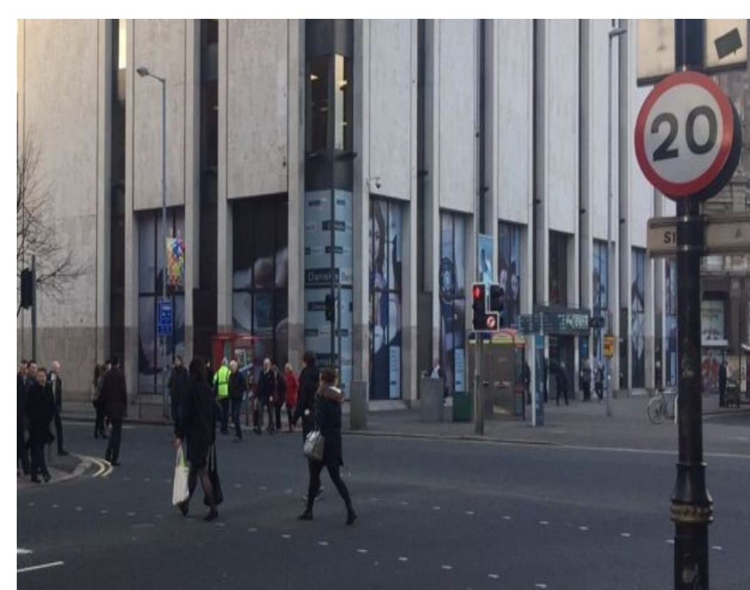
Photo 2. 20mph signage in Belfast City Centre.