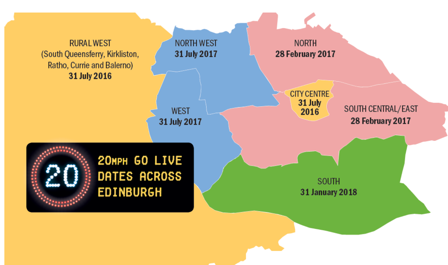
Figure 1. Map of phased introduction in Edinburgh.