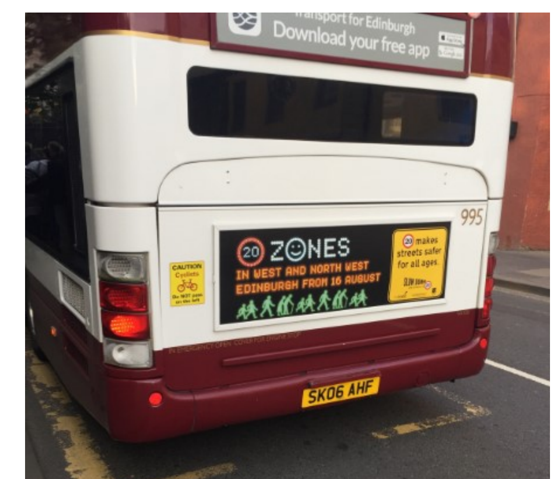
Photo 3. Awareness-raising on bus-back in Edinburgh.