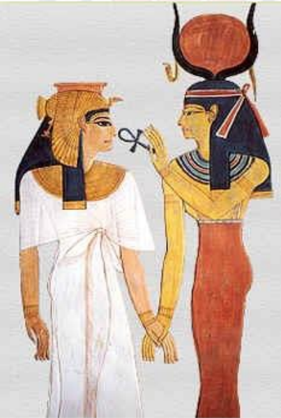
The goddess Hathor giving an ankh, representing "life", to Nefertari

King Ramesses was incredibly devoted to Nefertari and was obsessed with her beauty. The story of Ramesses and his admiration for his wife is considered one of the best interesting ancient Egypt stories, as this inspiring love story is so important to Egyptian history. [1]