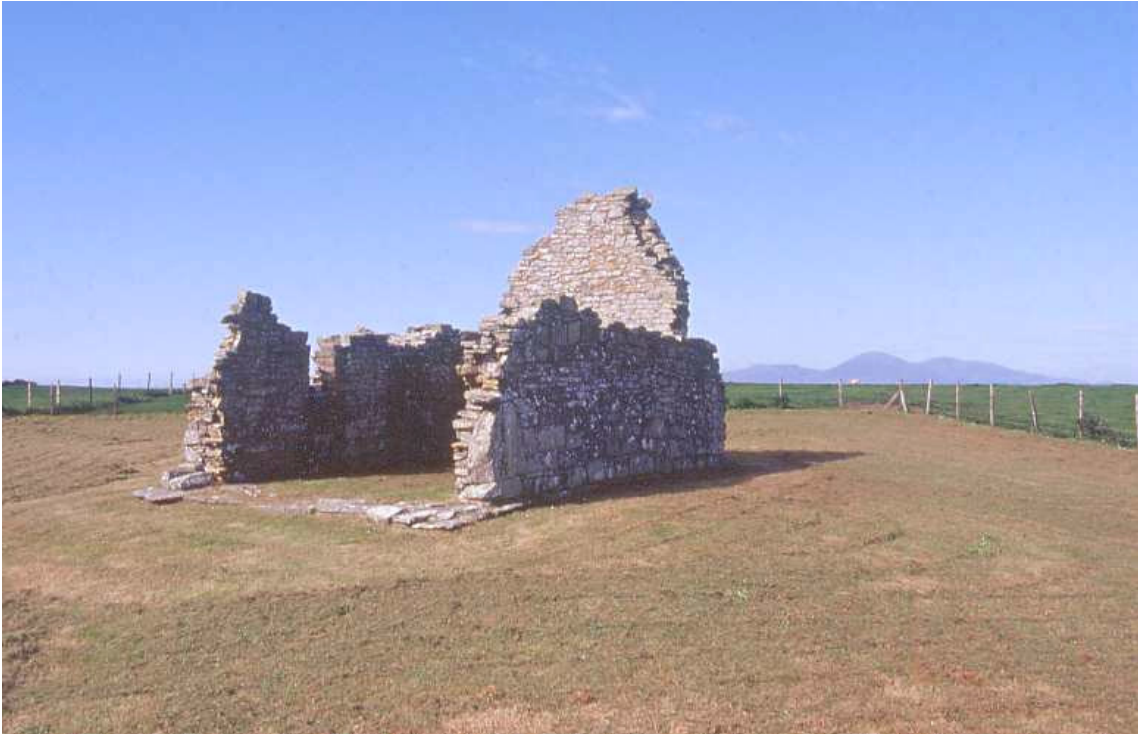
Plate 1: St John's Point Church facing south west.