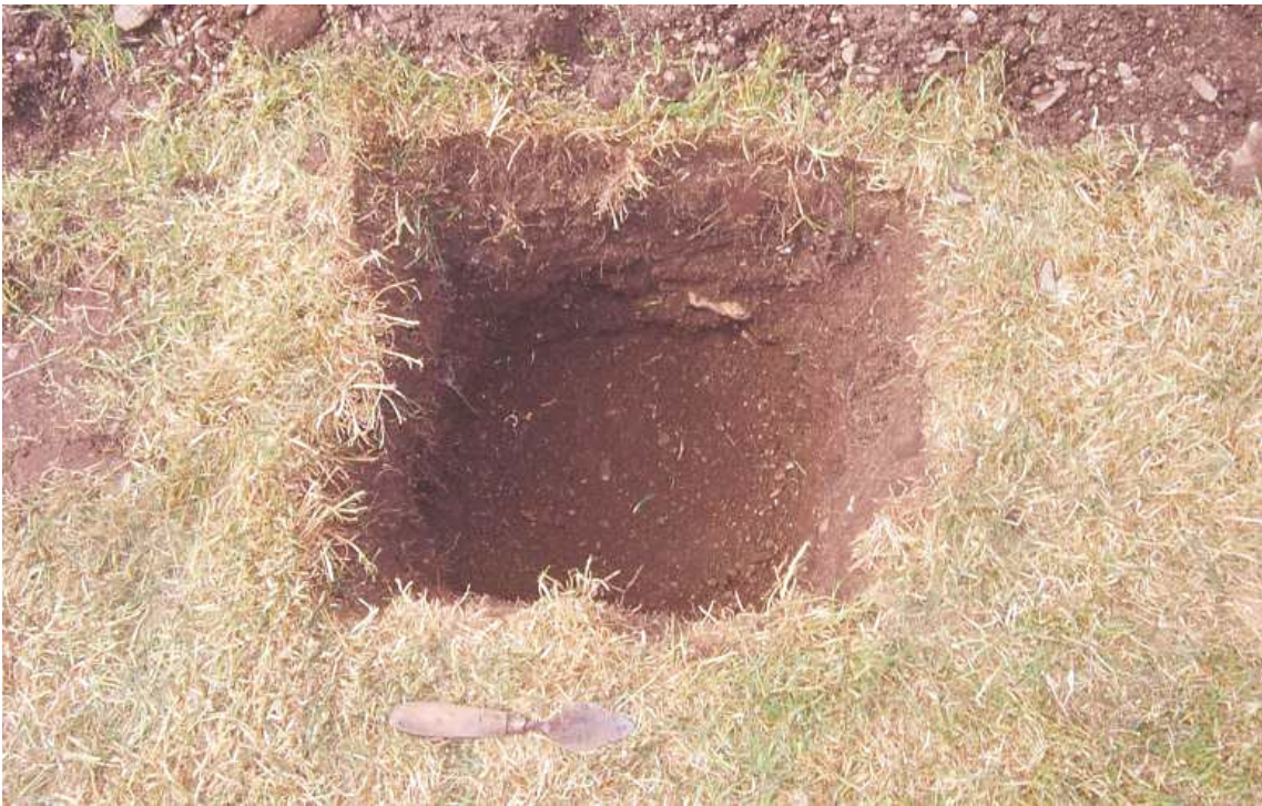
Plate 2: Trench One, Context No. 102, excavated to a depth of 0.5 m.