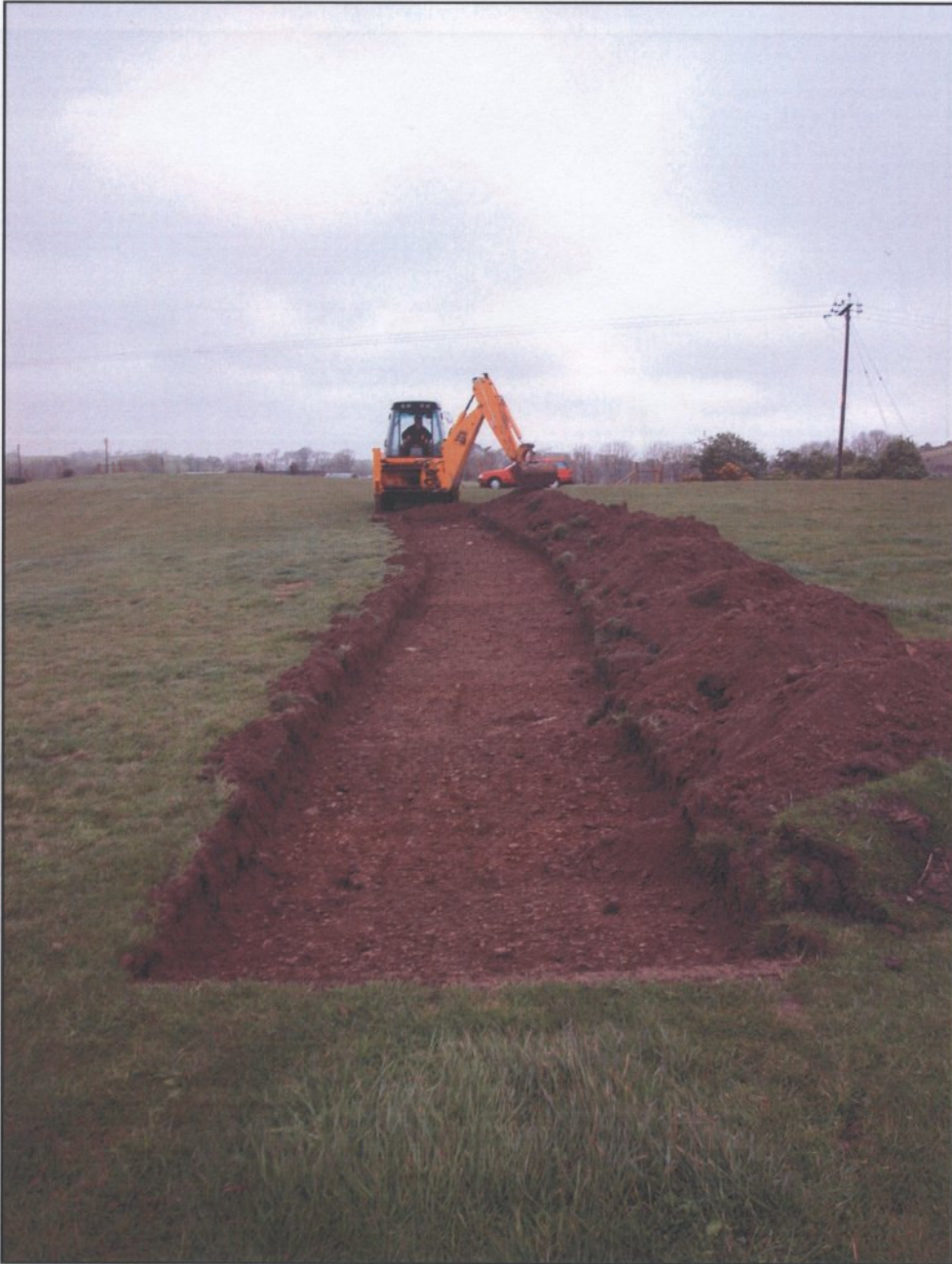
Plate One: Western test trench from the south.