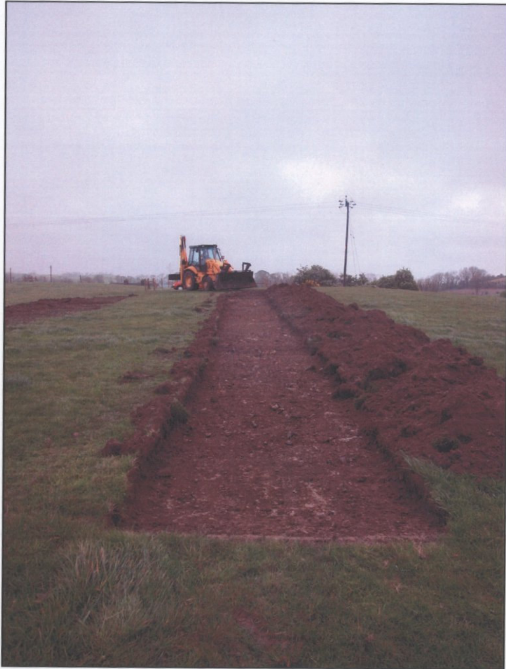
Plate Two: Eastern test trench from the south.