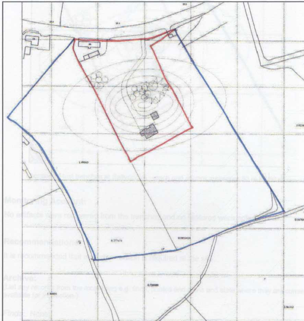
Plan of site issued by PHM showing location of proposed dwelling and garage. A possible quarry pit is present in the area marked by trees to the north of the dwelling — this area will not be affected by the development. Each grid square measures 50 m by 50 m.