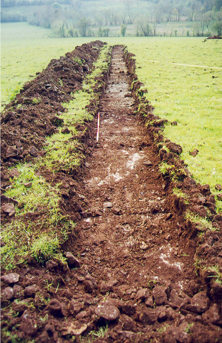
Photo 6: Trench 5 looking southwest after excavation showing surface of bedrock (Context 502).