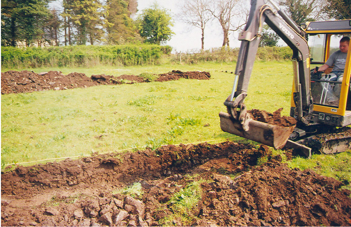
Photo 1: Excavation of trench showing utilization of toothless “sheugh” bucket.