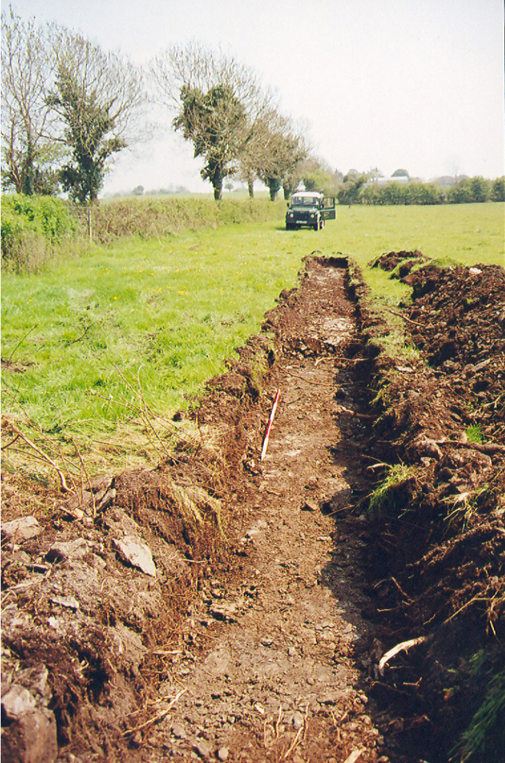
Photo 2: Trench 1 looking southeast after excavation showing surface of bedrock (Context 102).