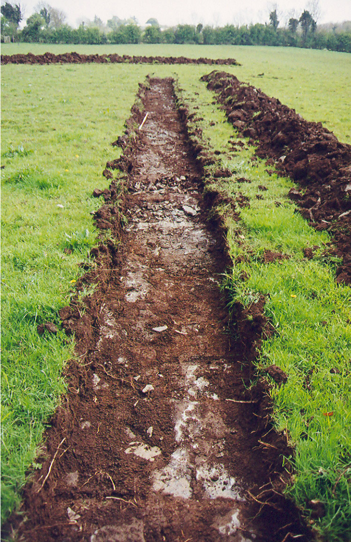
Photo 4: Trench 3 looking southeast after excavation showing surface of bedrock (Context 302).