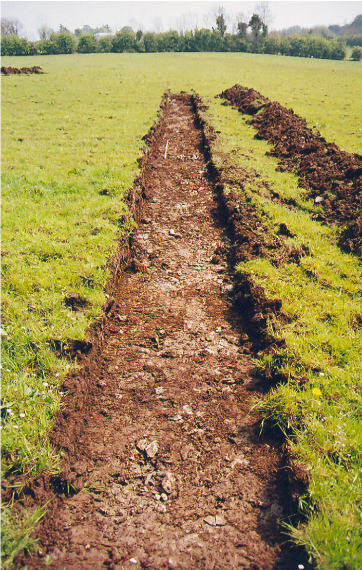
Photo 5: Trench 4 looking southeast after excavation showing surface of bedrock (Context 402).