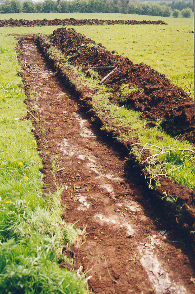
Photo 3: Trench 2 looking southeast after excavation showing surface of bedrock (Context 202).