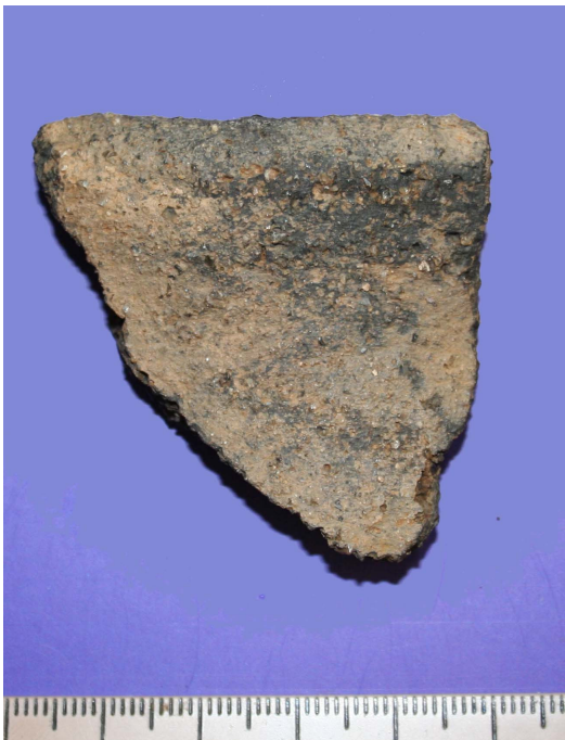
Plate 5: Vessel 1.

It is difficult to attribute small fragments of coarse pottery to either a potting tradition or to a period. To make accurate attributions of this nature it is necessary to have one or preferably a number of sherds displaying form / decorative motifs. Only one sherd of pottery from this site can definitely be attributed to a style or period, Vessel 1, the piece of Medieval Ulster Coarse pottery. Of the other sherds, Vessels 2, 5 and 6 are likely to Medieval also. Vessel 3 and Vessel 4 could be Neolithic as their fabric is reminiscent of that found on Neolithic sites. Given the proximity of the evaluation area to the suggested Neolithic site (Ant 018:044) it seems likely that these sherds are residual material mixed up with later finds in a Medieval pit.