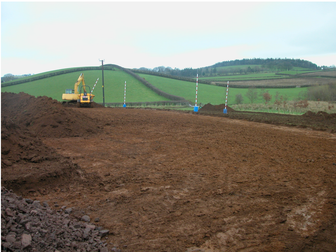
Plate 4: House site after removal of topsoil, looking north.