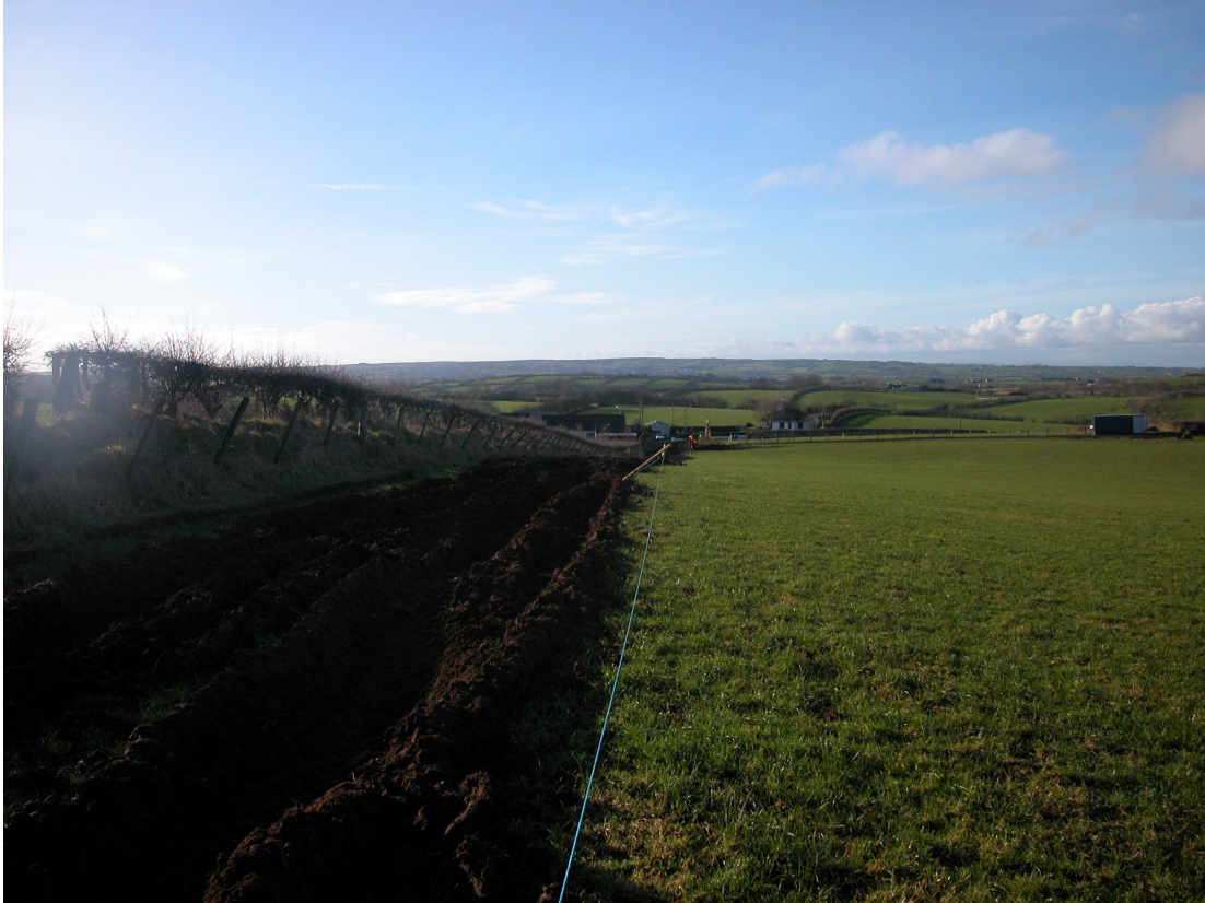
Plate 3: Access road looking south-west towards Ballyportery Road.