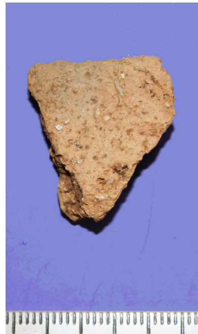
Plate 6: Vessel 2.