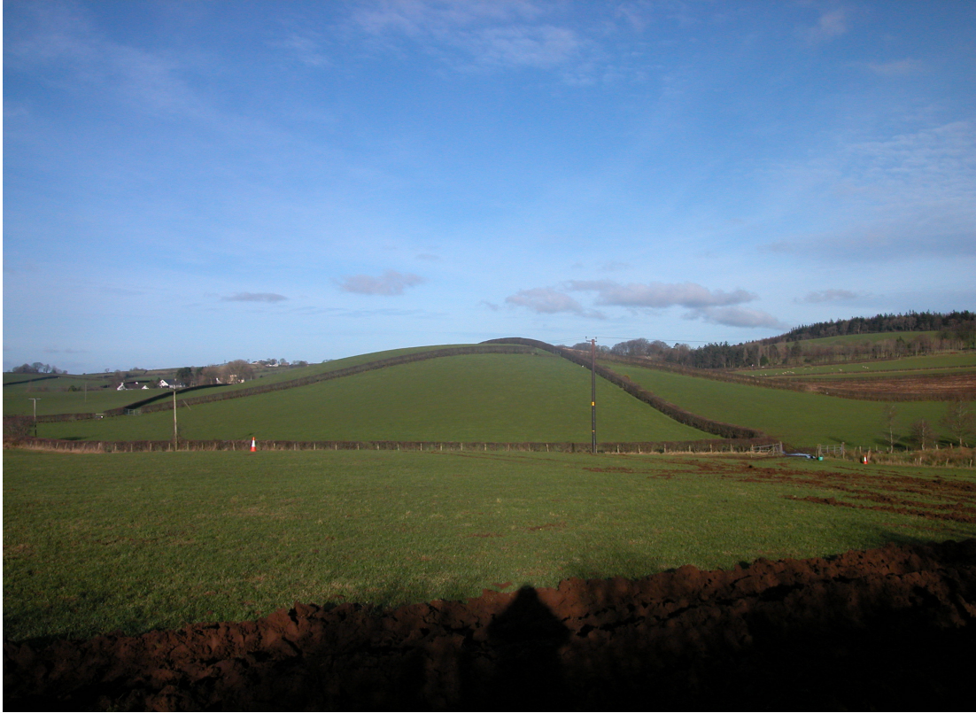
Plate 1: Hill where ANT 018:044 is situated, looking north-west from application site.