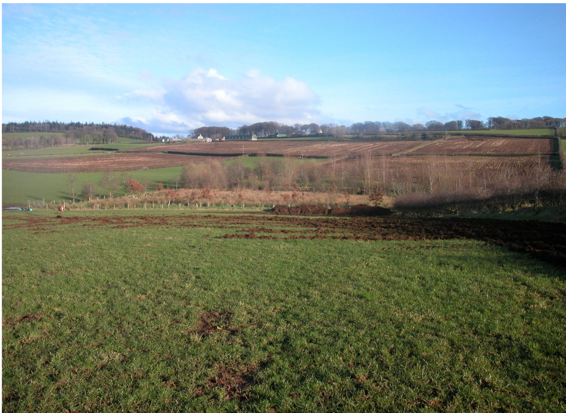
Plate 2: House/garden area of application site, looking north-east.