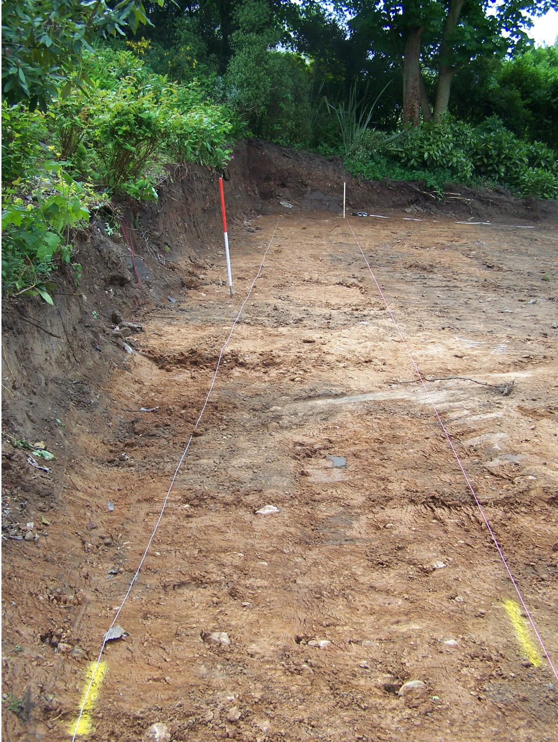
Plate 4 General shot looking SW showing the proposed development site after topsoil stripping.