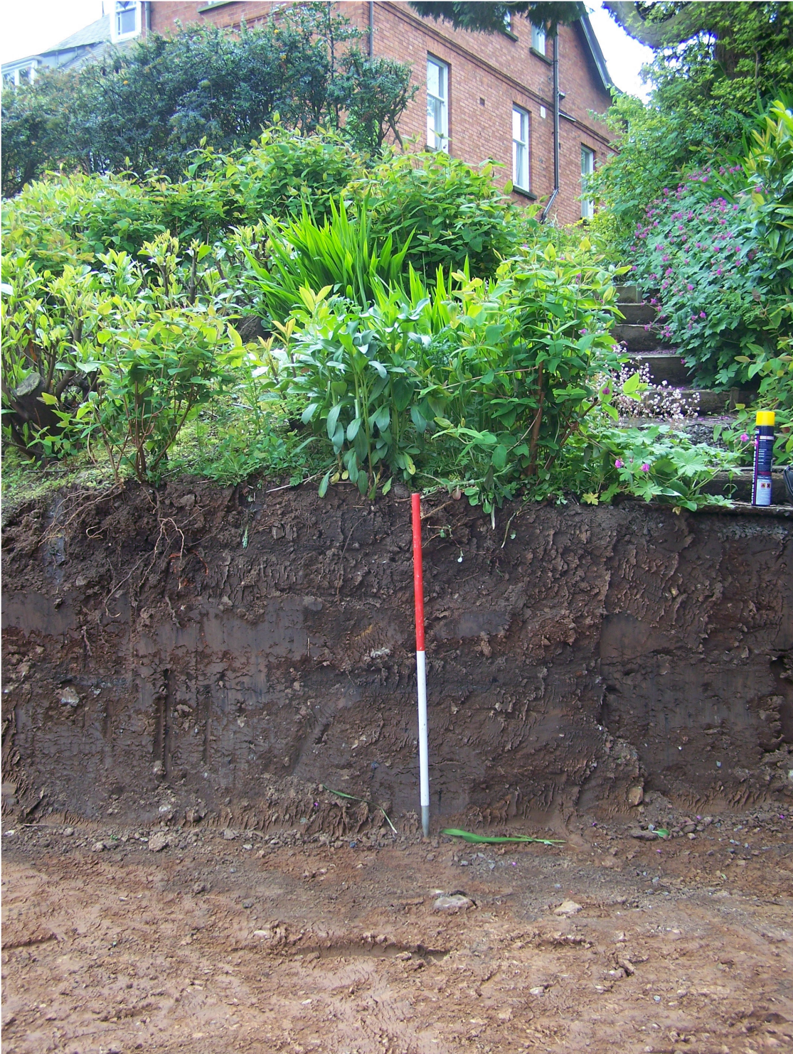
Plate 3 Shot looking NE showing the depth of modern landscaping towards the existing building at Ardshane Lodge.