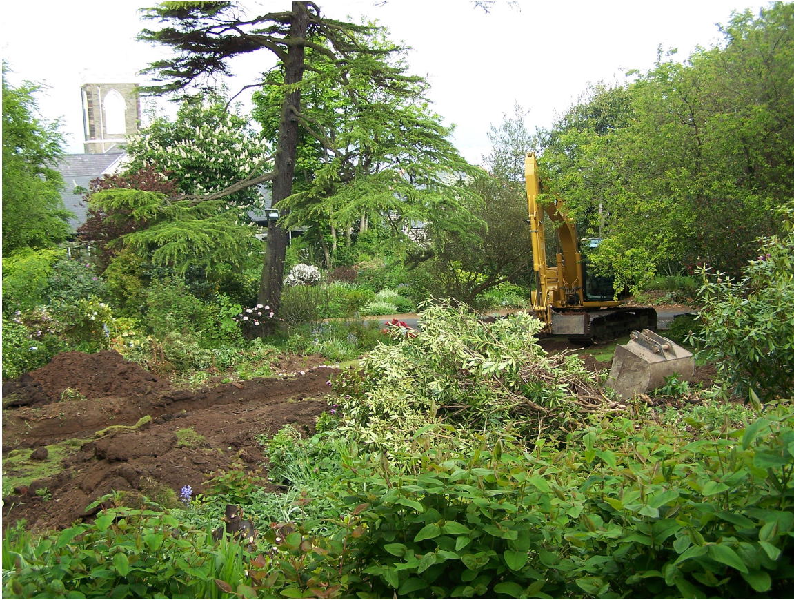
Plate 1 General shot showing scale of the mature planting. Looking NW.