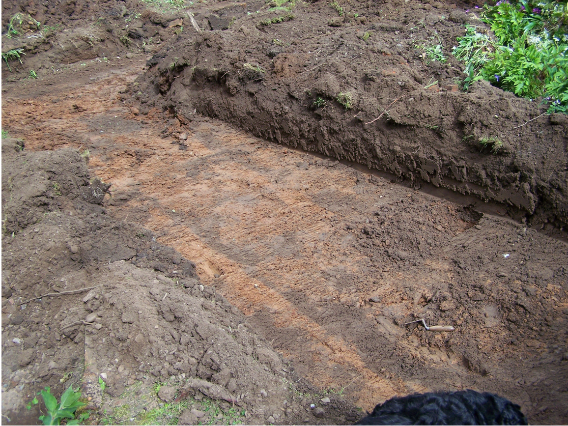
Plate 2 General shot showing the reddish orange glacial subsoil (Context No. 103)