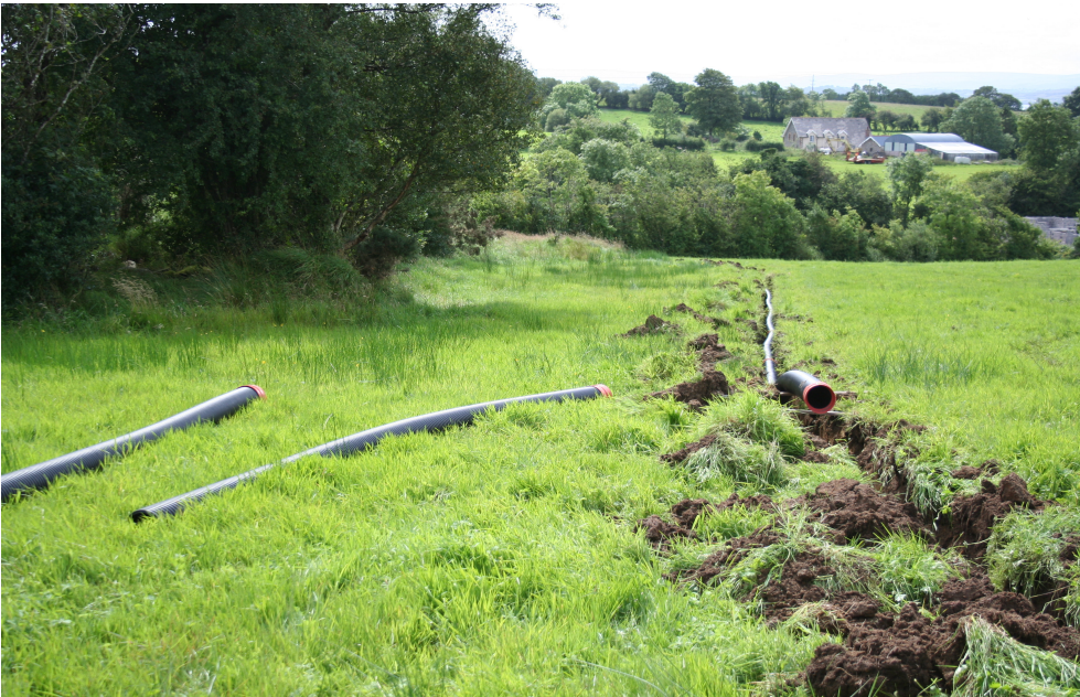
Plate 3: Trench and rath outer bank, looking south.