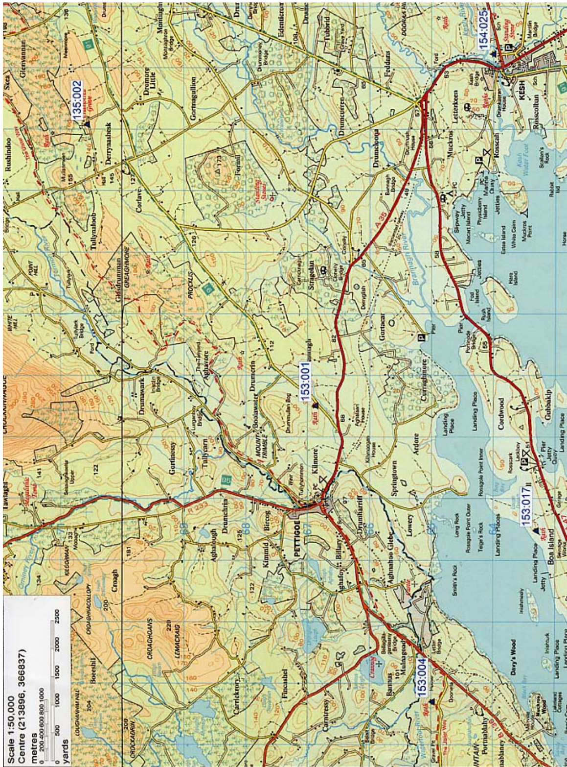
Figure 1: 1:50,000 map showing location of site (153:001).