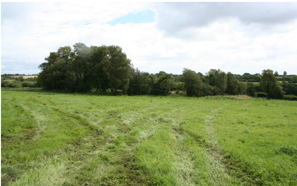
Plate 1: Rath, looking south-east.