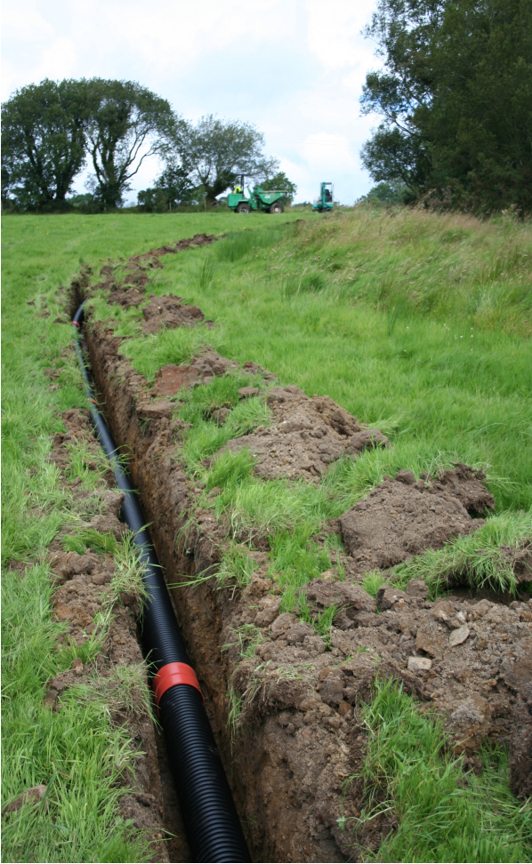
Plate 2: Trench with plastic pipe in situ and rath outer bank, looking north.