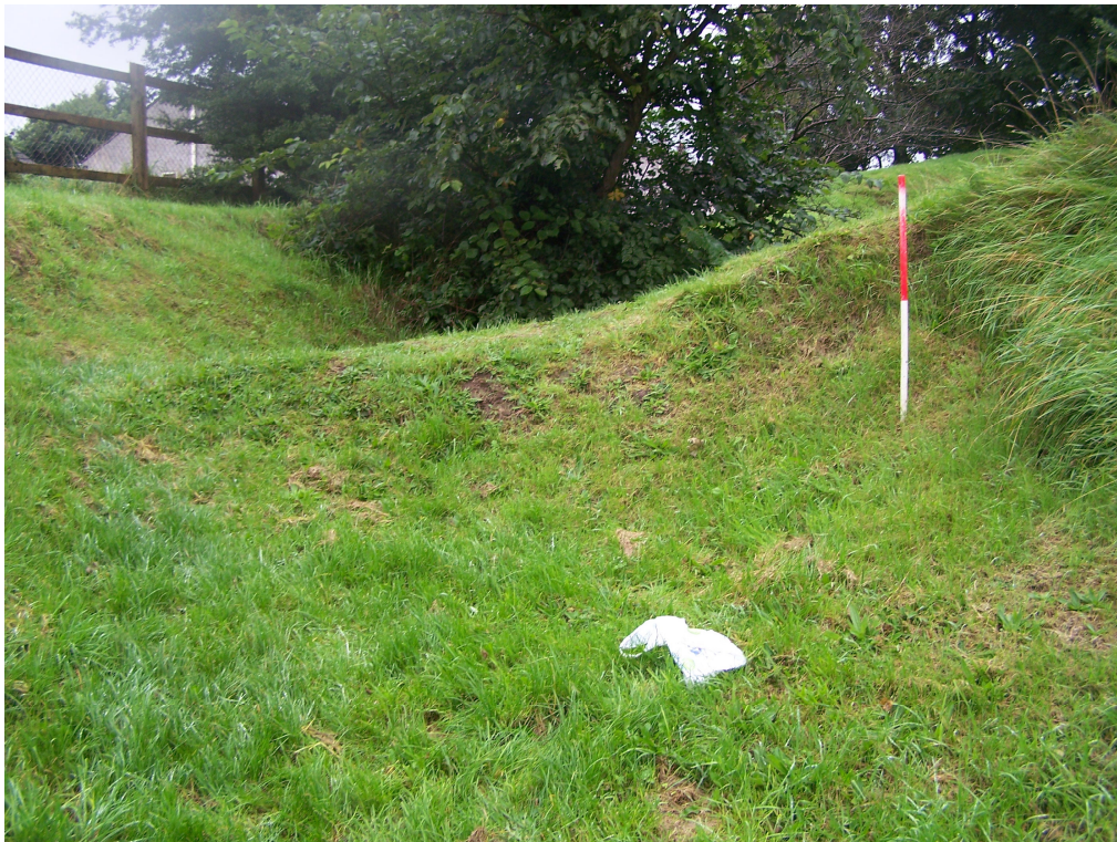
Plate 3: Modern Causeway across the ditch at the base of the motte, looking east.