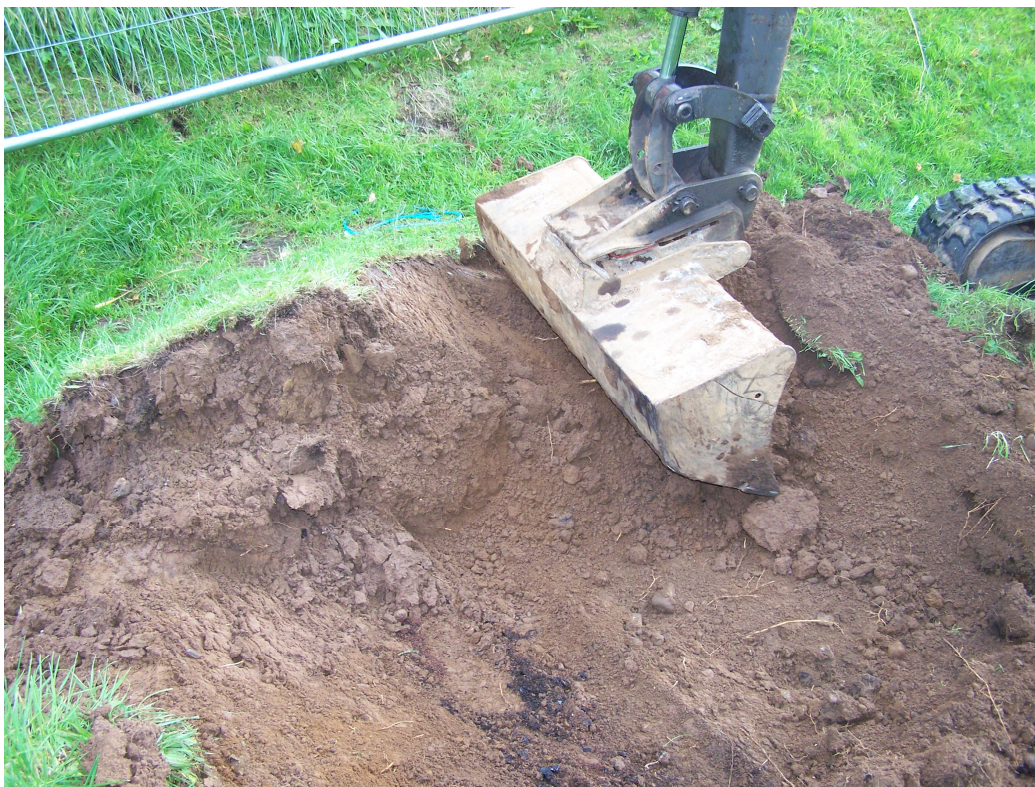
Plate 4: Excavation of the causeways by mechanical digger.