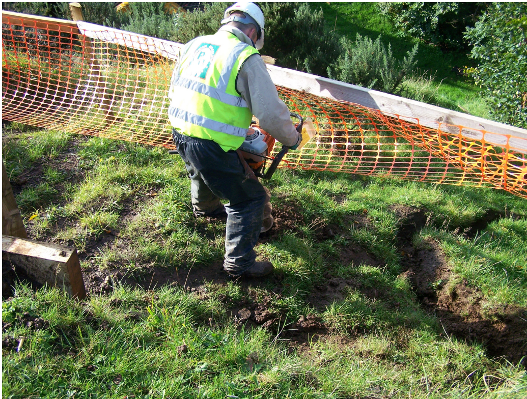
Plate 5: Excavation of the holes for the support uprights of the retaining fence, looking west.