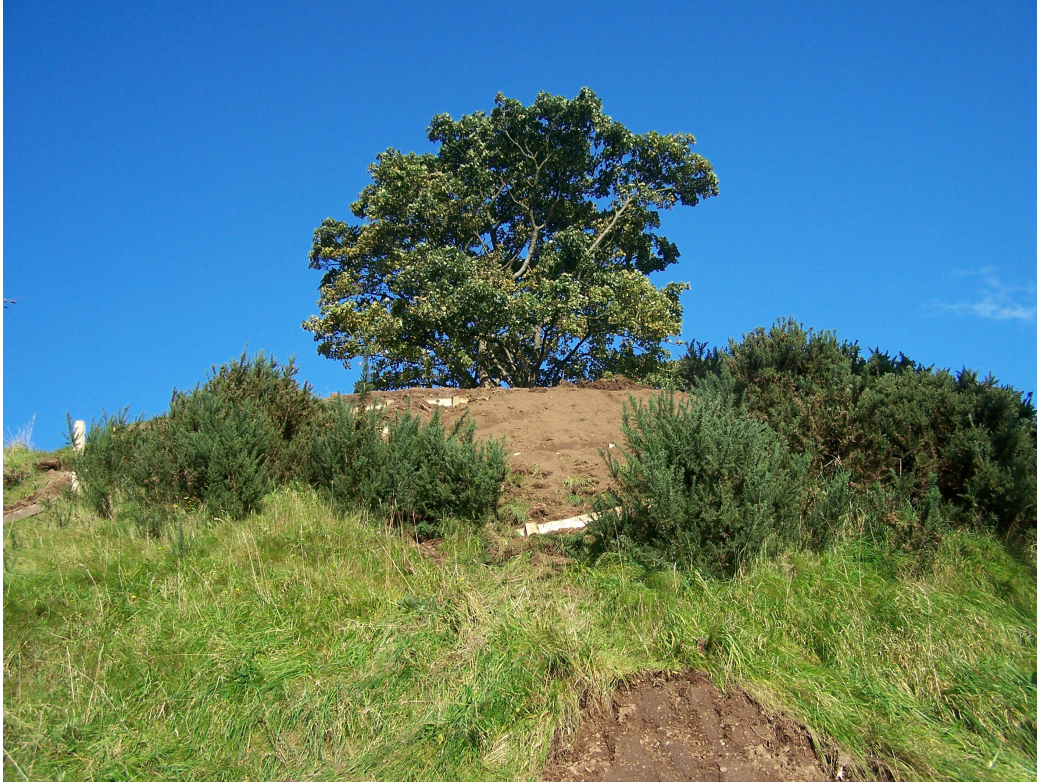
Plate 7: view of the top of the motte following the consolidation works. Geo-textile was then spread over the fresh earth and grass seed planted, looking north-east.