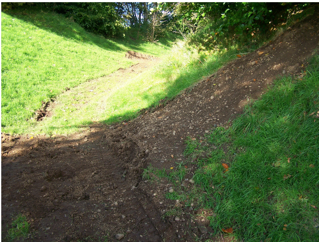
Plate 6: One of the causeways following excavation, looking north-east.