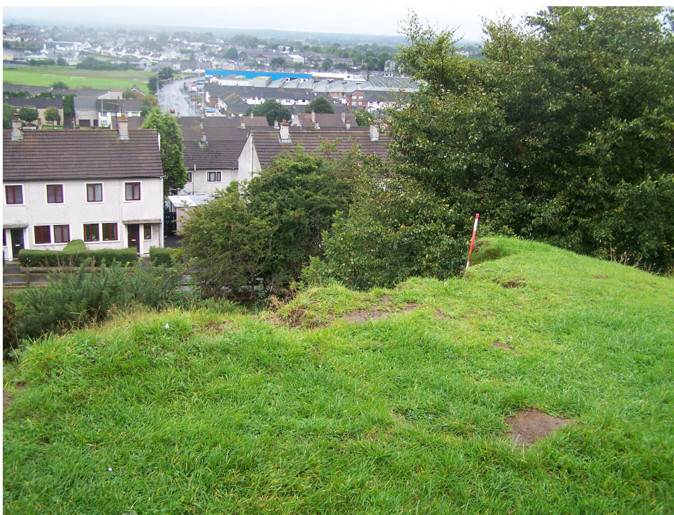
Plate 2: Erosion scar at the top of the motte, looking west