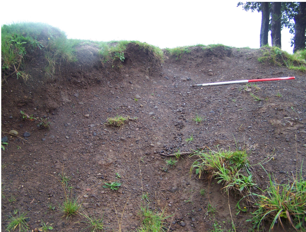
Plate 1: Erosion scars at the top of the motte, looking east.