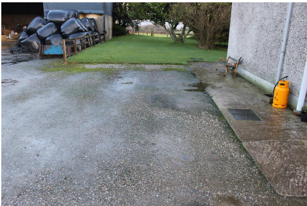
Plate 1: Area of the extension, looking north