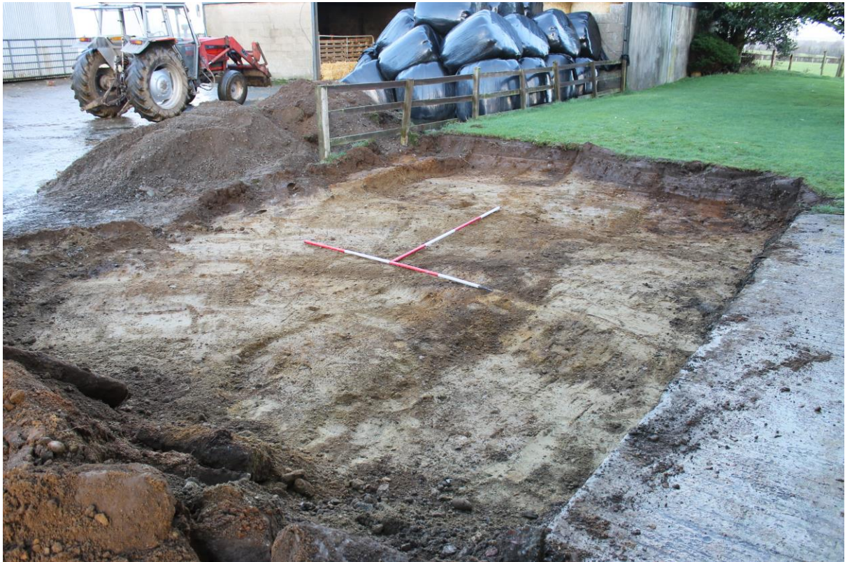
Plate 3: Trench 1, surface of the natural subsoil (c203), looking north-west