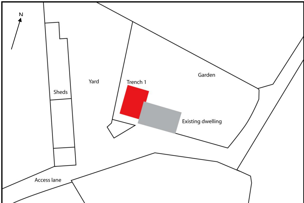
Figure 3 – Site plan showing locations of test trench (Scale 1:500)