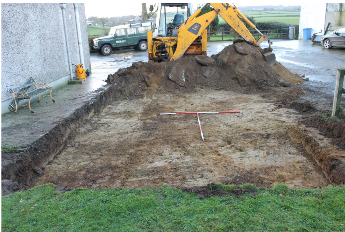
Plate 2: Trench 1, surface of the natural subsoil (c103), looking south